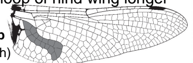
LIBELLULIDAE anal loop (area darkened in sketch)

10b). Colored otherwise; thorax with no more than sparse, short hairs; anal loop of hind wing longer and pointed at tip..... LIBELLULIDAE (Skimmers)